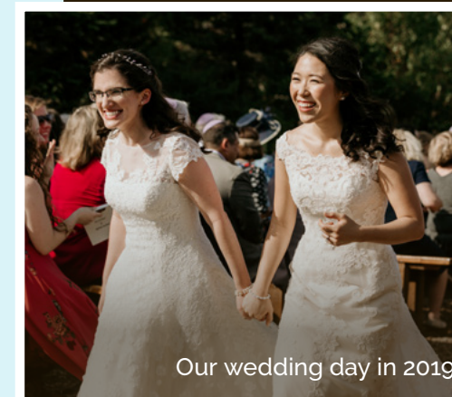
Our wedding day in 2019