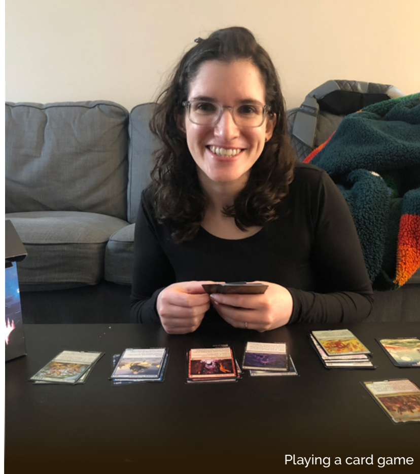
Playing a card game