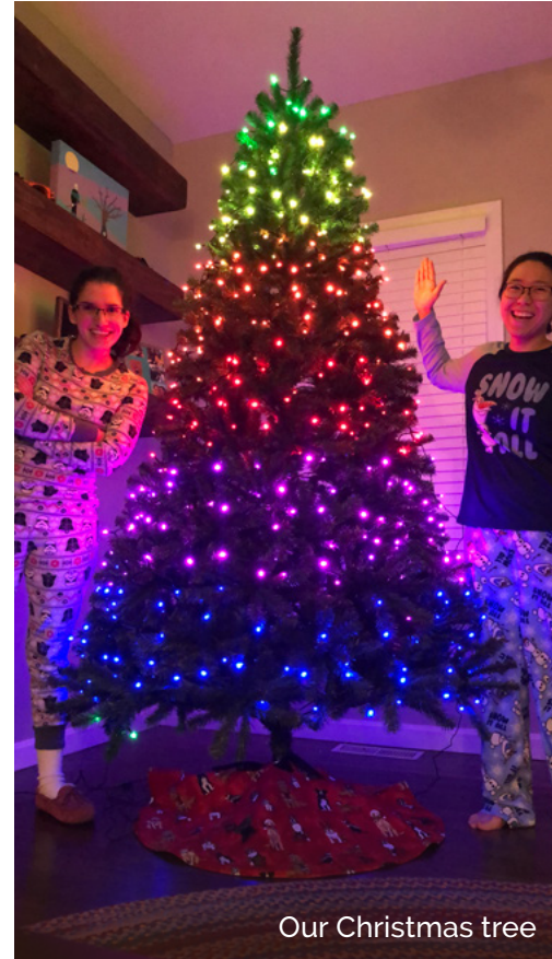
Our Christmas tree