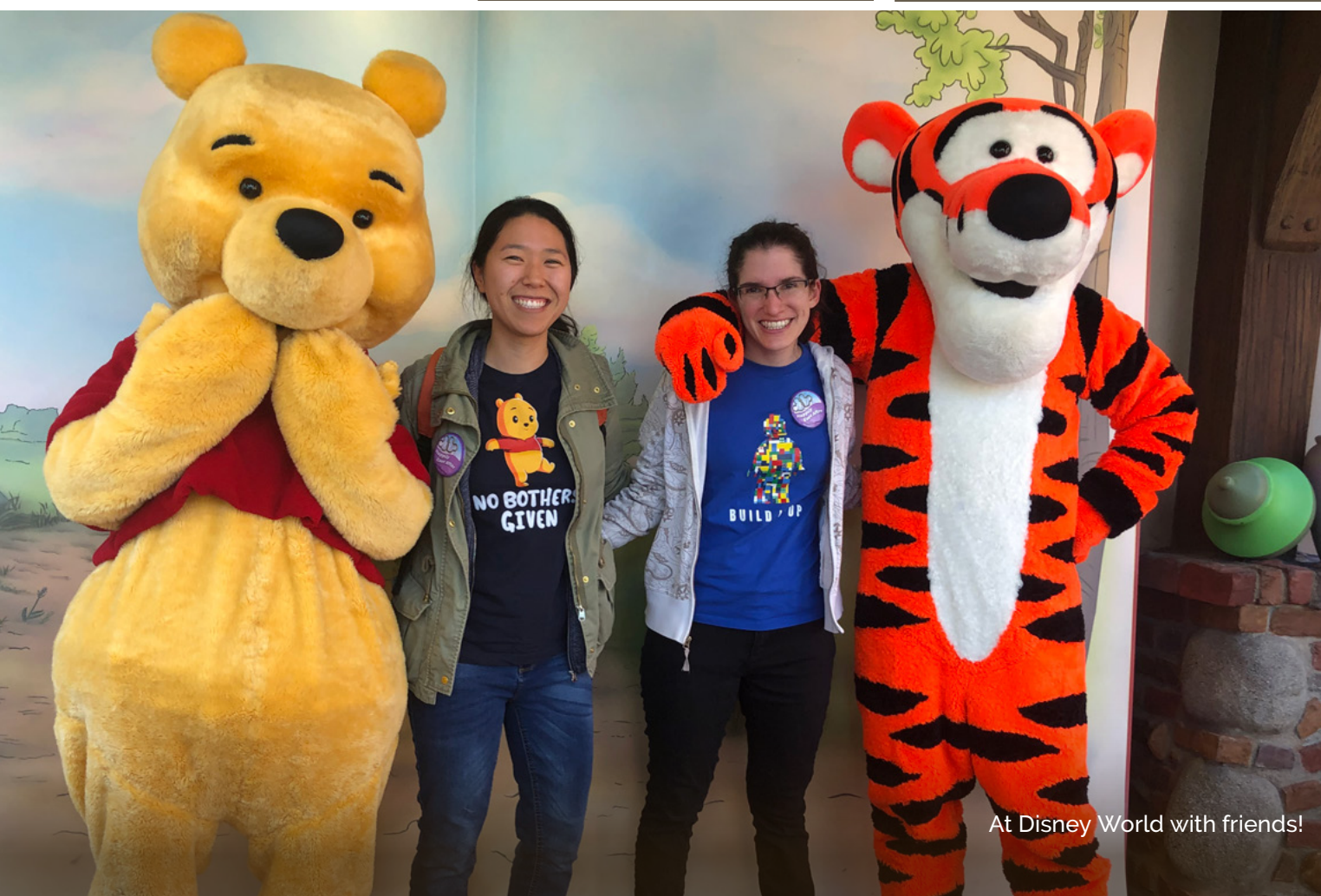
At Disney World with friends!