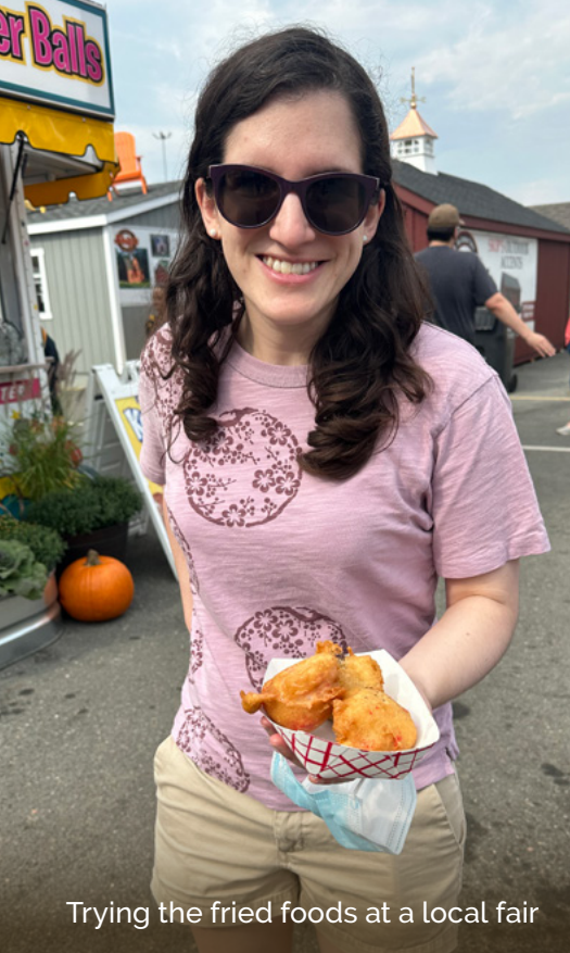
Trying the fried foods at a local fair