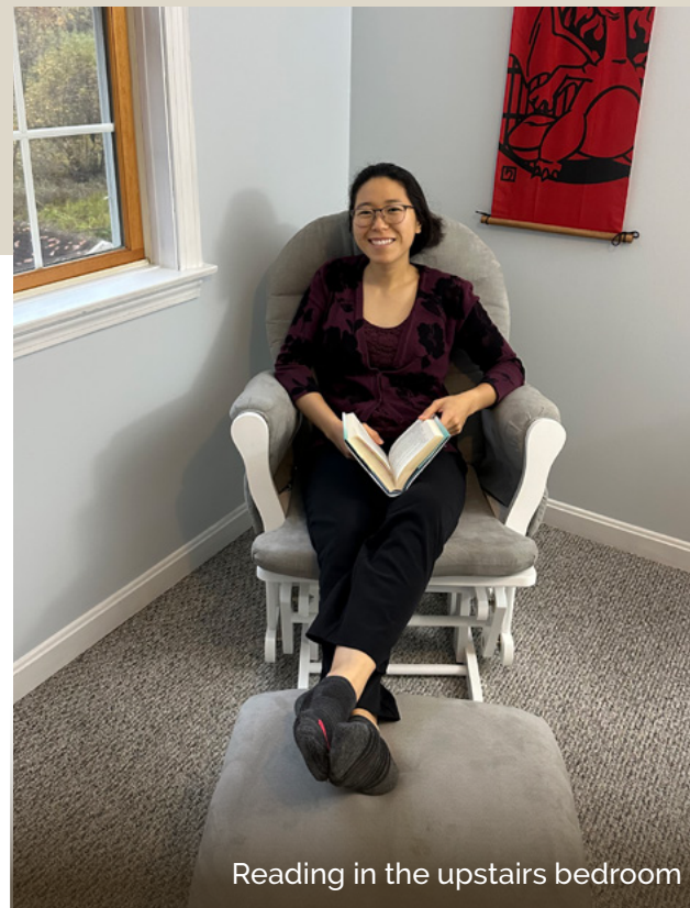
Reading in the upstairs bedroom

Our house resides on about a half-acre of land with a front and back yard. There is a designated space in the back for a playground set, which Sarah's dad is very antsy to build during his retirement. Our front porch looks out onto the neighborhood, and the back porch looks out onto forested conservation land. We sometimes even have wildlife visitors, like deer, stop by!