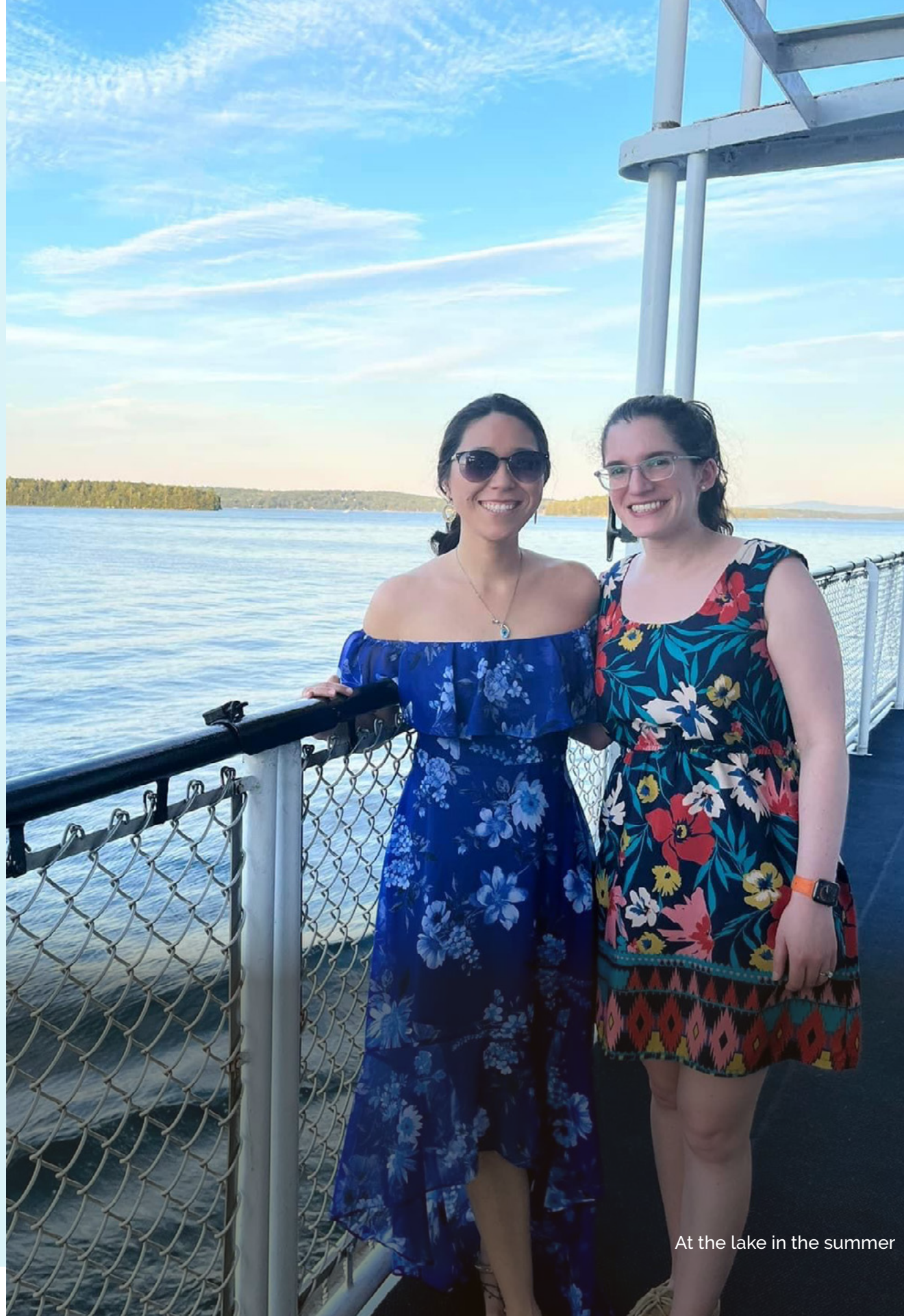
At the lake in the summer