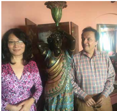
A TRIP TO LAGUNA BEACH