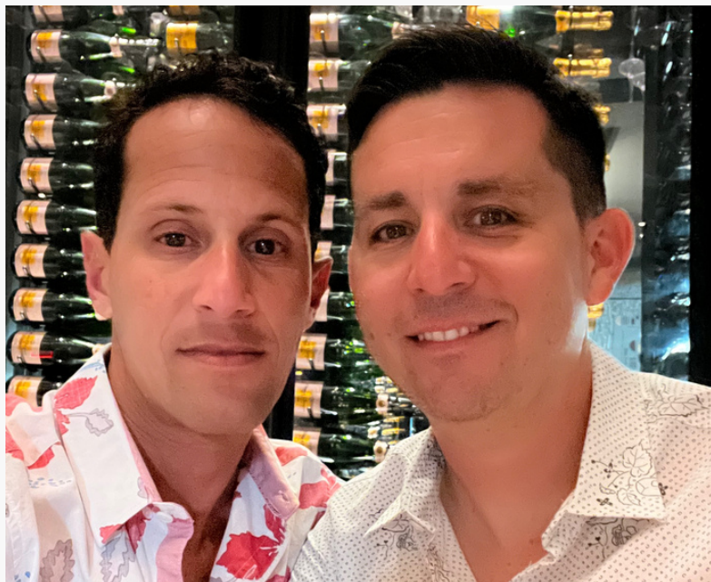
DINNER DOWNTOWN LA