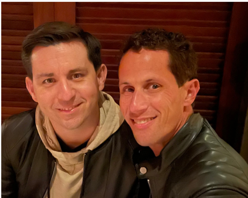
OUR FAVORITE RESTAURANT