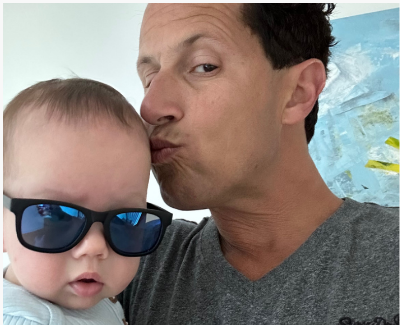
JORDAN'S FIRST COUNTRY CONCERT!