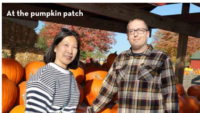
At the pumpkin patch