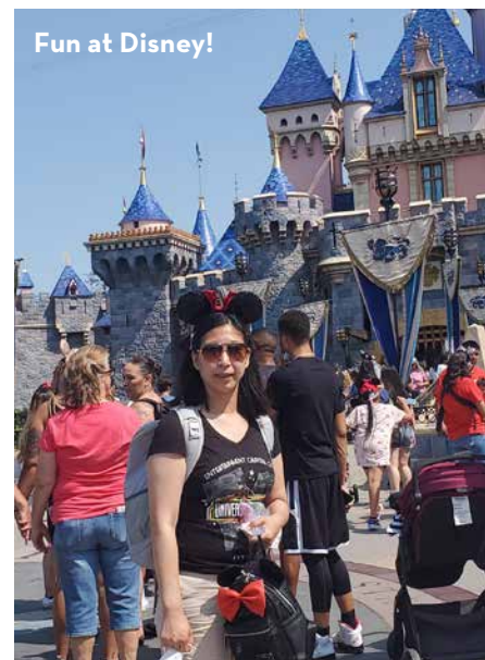
Fun at Disney!