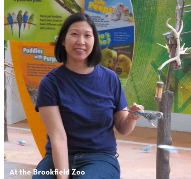
At the Brookfield Zoo