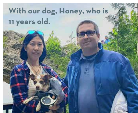
With our dog, Honey, who is 11 years old.