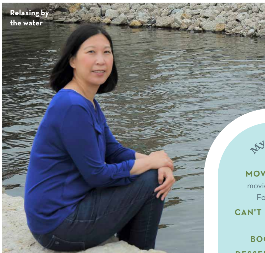
Relaxing by the water