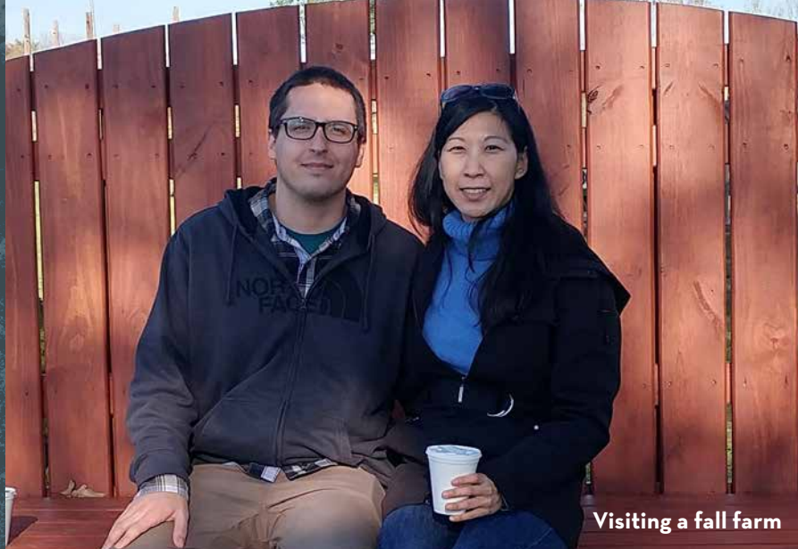
Visiting a fall farm