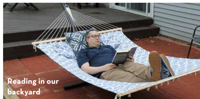
Reading in our backyard