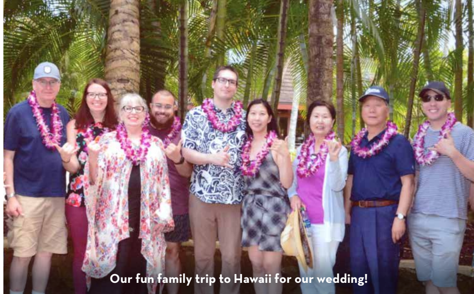
Our fun family trip to Hawaii for our wedding!