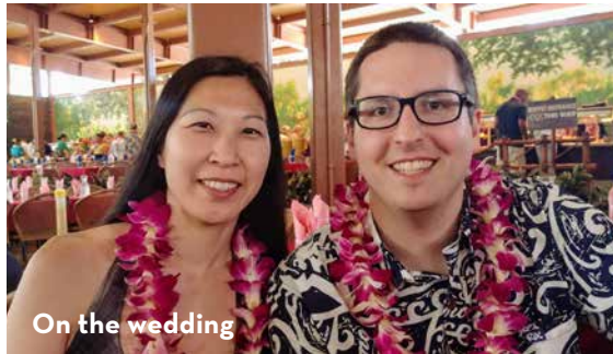
On the wedding

We feel that God has prepared us both in life to grow as individuals and as a couple, and we want to use our growth experiences as well as our gifts and talents to build our family through the gift of adoption.