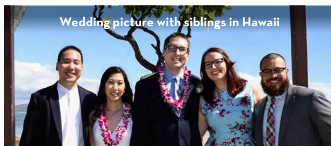
Wedding picture with siblings in Hawaii