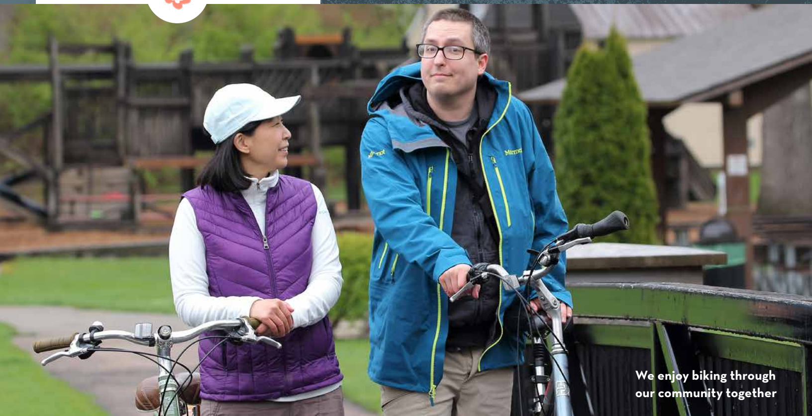
We enjoy biking through our community together