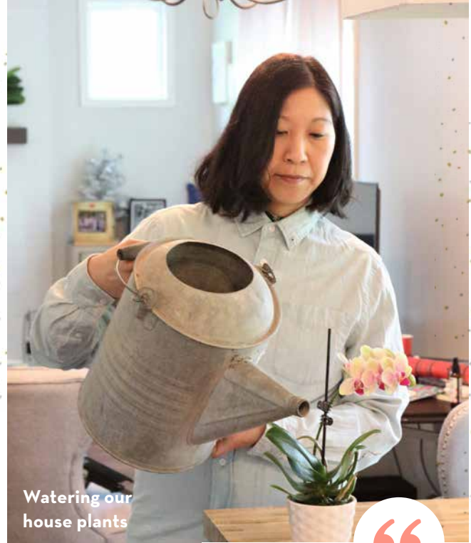
Watering our house plants