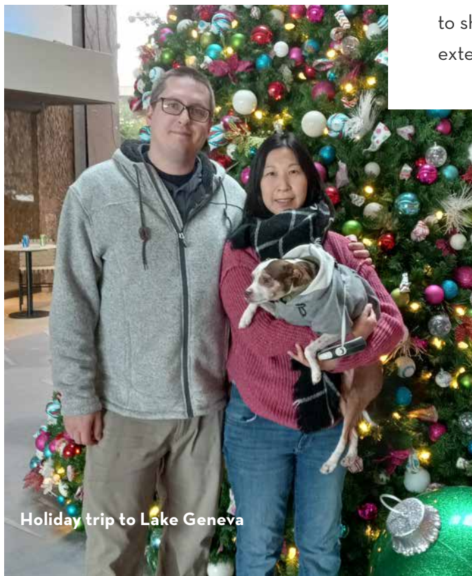
Holiday trip to Lake Geneva

We are committed to our roles as potential parents. We would like you to know that we promise to give this child ample opportunities to learn and to explore the world around them, and that we will be there to celebrate their stories along the way. We are incredibly blessed to have a loving and supportive group of family and friends who are committed to sharing their world with them. We are so excited and grateful to extend our lives to you as we embark on this potential journey together.