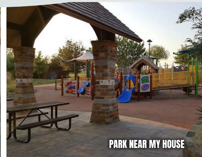
PARK NEAR MY HOUSE