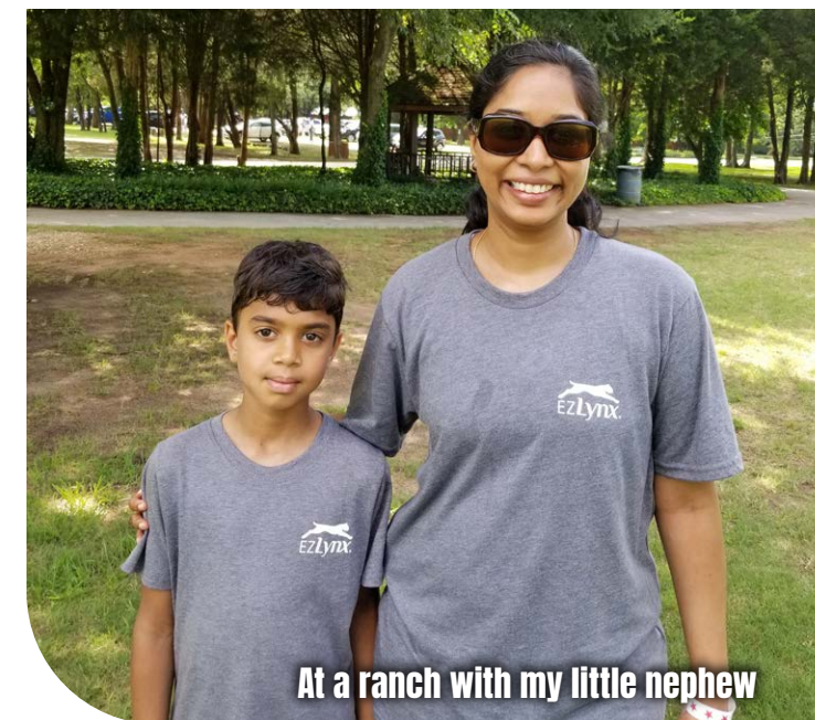
At a ranch with my little nephew

My family is excited for me to share my heart with a new baby as they know I've always wanted to be a mom. I have a great support system of family and friends. With a birth mother's blessing, I will share my love and support with a child.