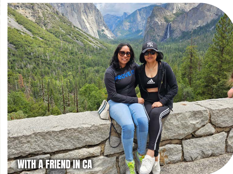
WITH A FRIEND IN CA