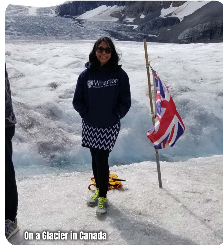
On a Glacier in Canada