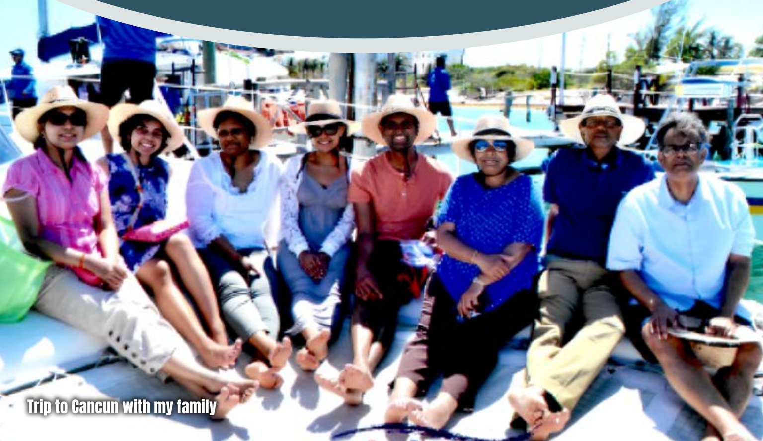
Trip to Cancun with my family