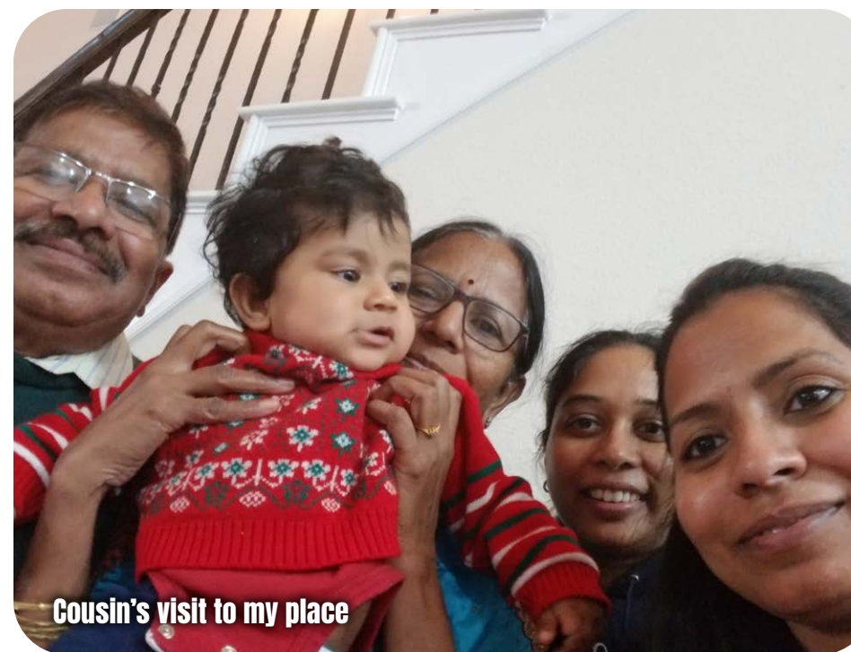
Cousin's visit to my place

I live in the city, central to everything, in a diverse and vibrant neighborhood full of sculptures, museums, and parks. We can walk to several parks including the second largest park in the city. The public library is just three blocks away and hosts Baby and Toddler Storytime weekly. Our neighborhood is zoned to a district with several great schools where the child will receive an excellent education.