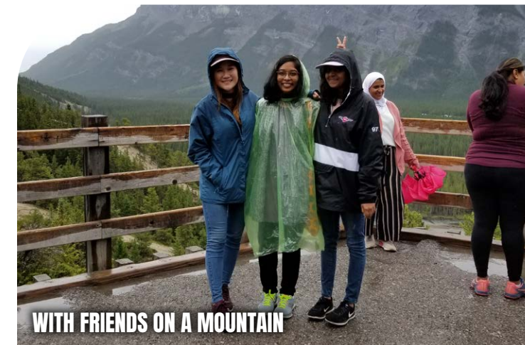
WITH FRIENDS ON A MOUNTAIN

I am so blessed to have many wonderful children in my life. I have my nephews in Dallas, cousins spread across various states in the USA and India, and a fantastic array of friends' children. I am full of hugs and kisses for the children in my life! I love to cuddle up on the couch, read storybooks, and do art projects. I can't wait to be a mom!