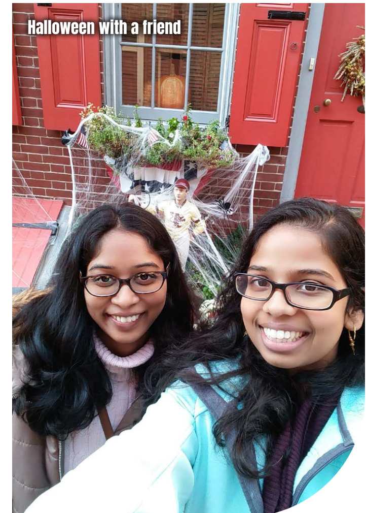
Halloween with a friend