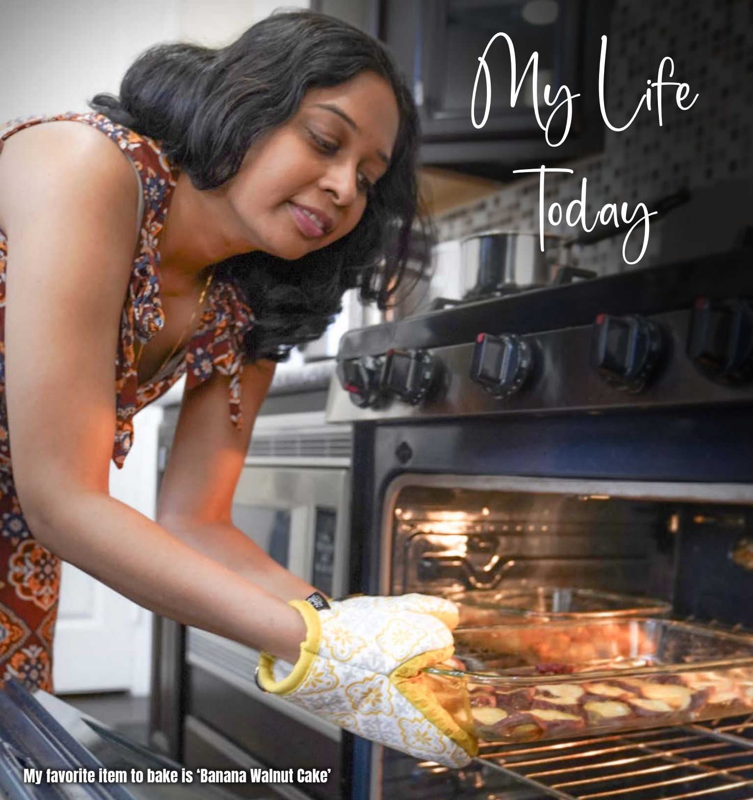
My favorite item to bake is 'Banana Walnut Cake'

What I Do: I manage software projects and teams. I have a Master's degree in Computer Science, and work from home with the flexibility to choose my work hours. I teach programming to middle schoolers and high schoolers during my free time. I enjoy teaching music to little kids and have fun singing along with them.