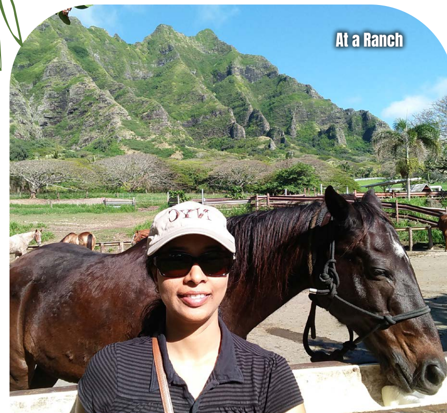
At a Ranch

I love to travel and especially love to try new foods—I can read menus in three different languages. I can't wait to show a child a world full of different cultures, foods, languages, and adventures! I love the diversity of Texas, which offers so much close to home, too.