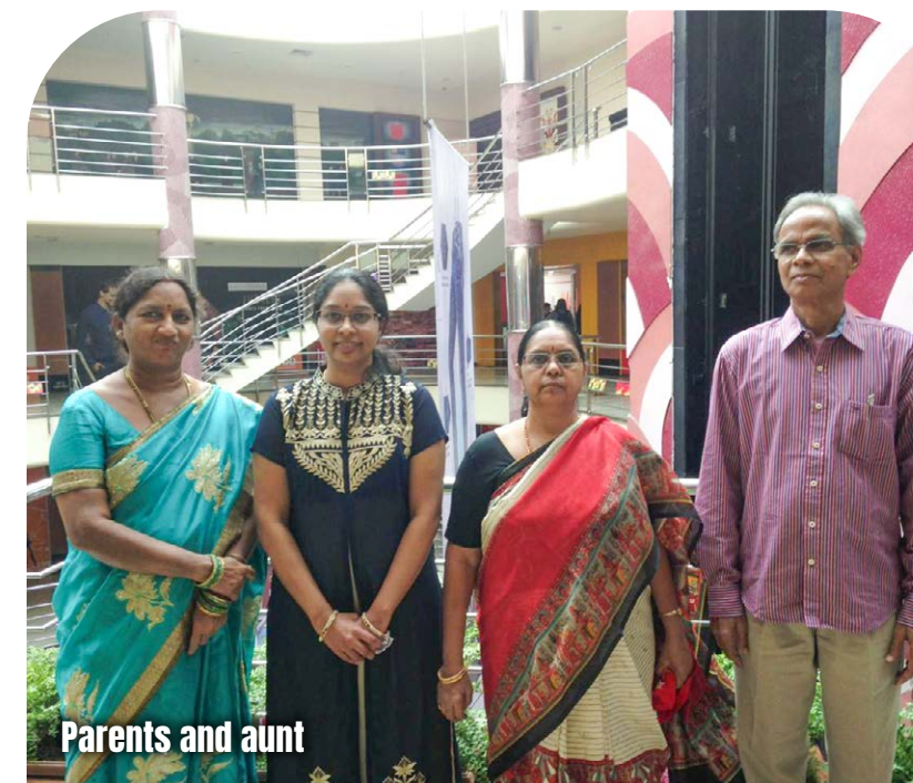
Parents and aunt

We are a diverse family. I have cousins spread across various states in the USA and also in India. I have an older sister who lives three miles away and two cousins who live in Dallas. Everyone is so thrilled and excited to welcome a baby into our family.