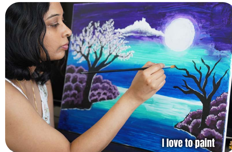
I love to paint