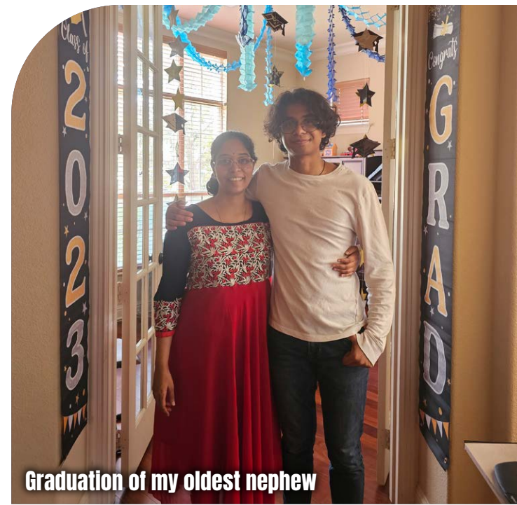
Graduation of my oldest nephew