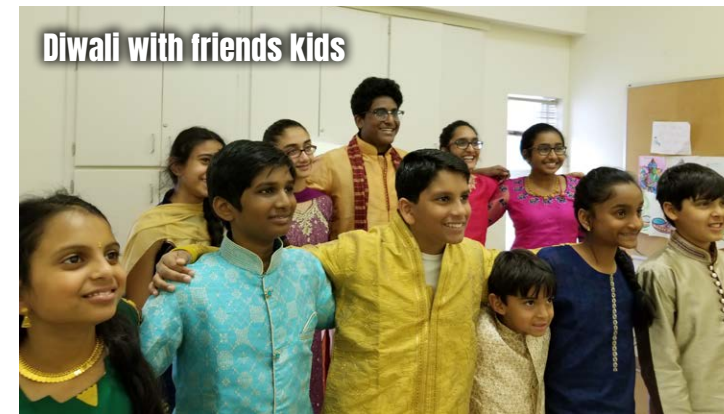
Diwali with friends kids