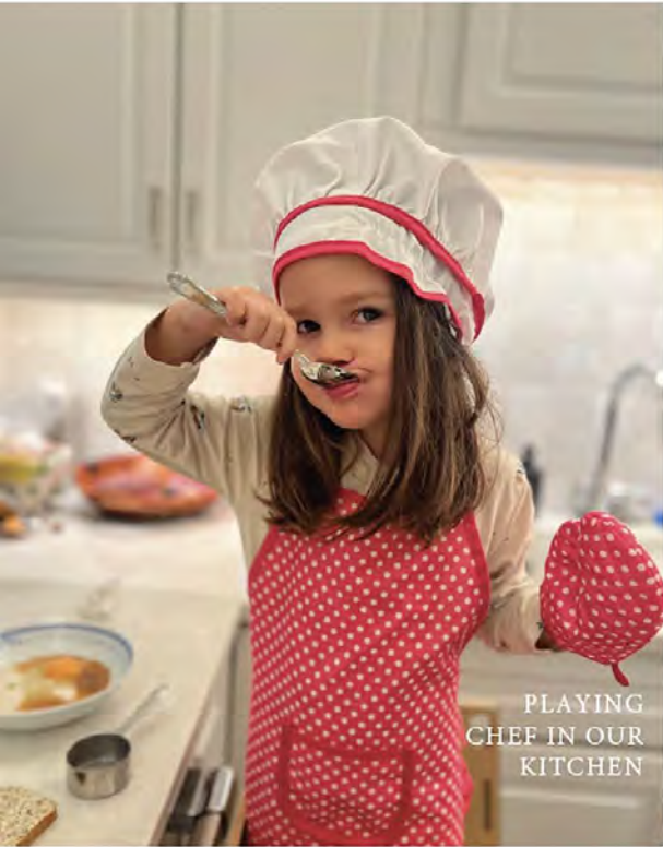
PLAYING CHEF IN OUR KITCHEN