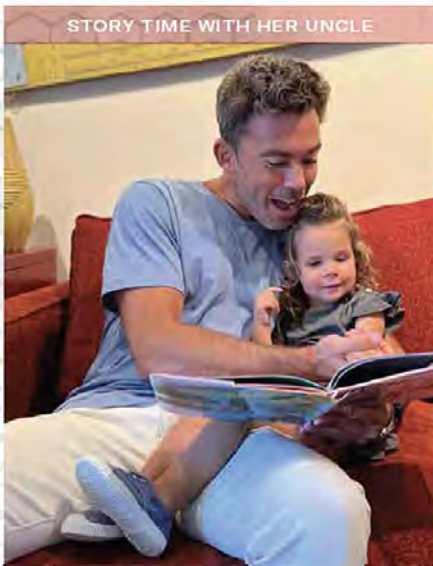
STORY TIME WITH HER UNCLE