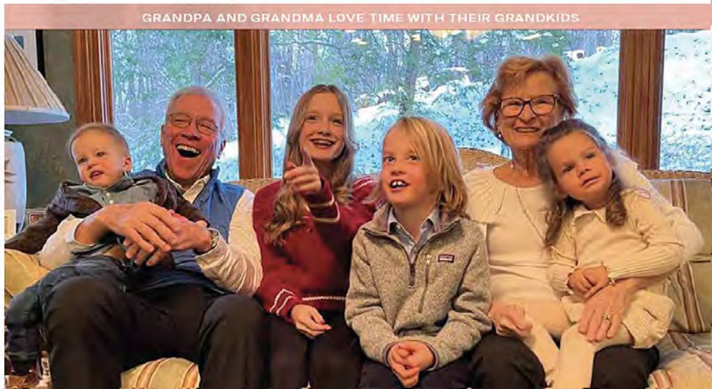
GRANDPA AND GRANDMA LOVE TIME WITH THEIR GRANDKIDS