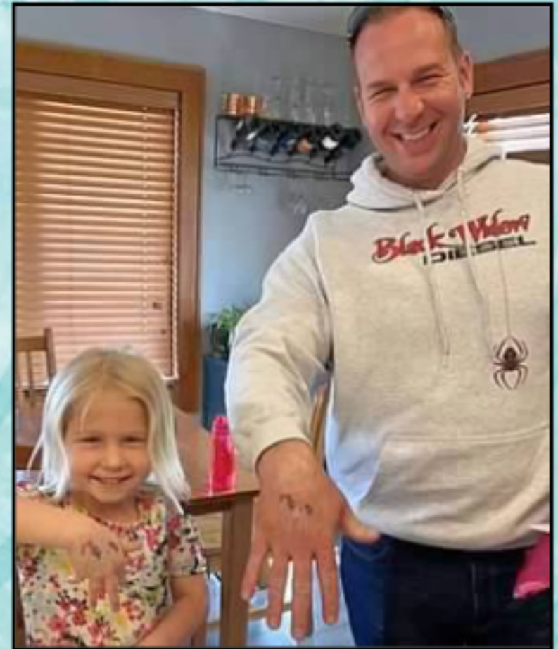
Girl dad in training !