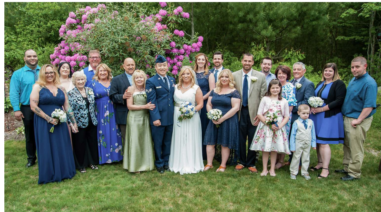
Our big immediate family - parents & step siblings & niece and nephew at our wedding!