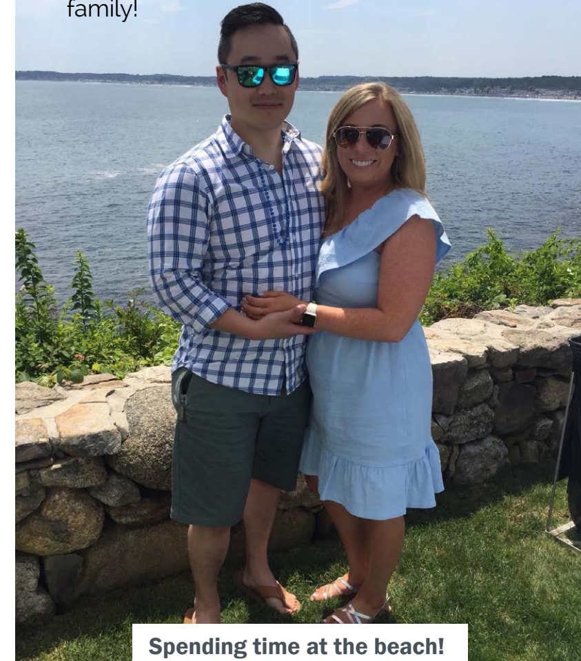
Spending time at the beach!