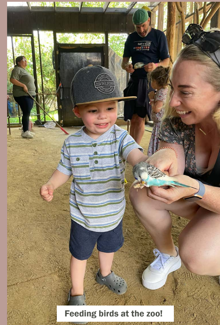
Feeding birds at the zoo!

She grew up playing many sports throughout her youth and into high school and excelled in basketball and softball.