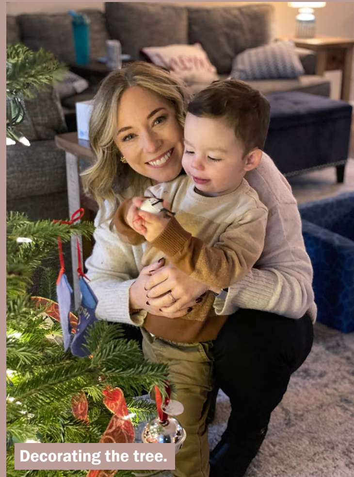
Decorating the tree.