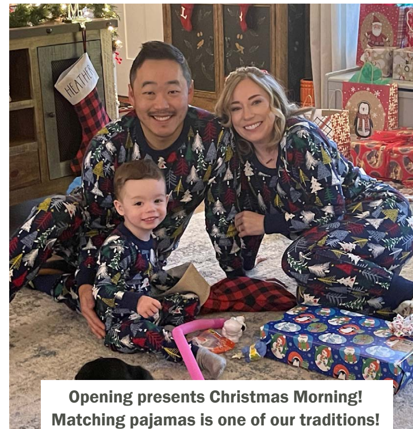
Opening presents Christmas Morning! Matching pajamas is one of our traditions!