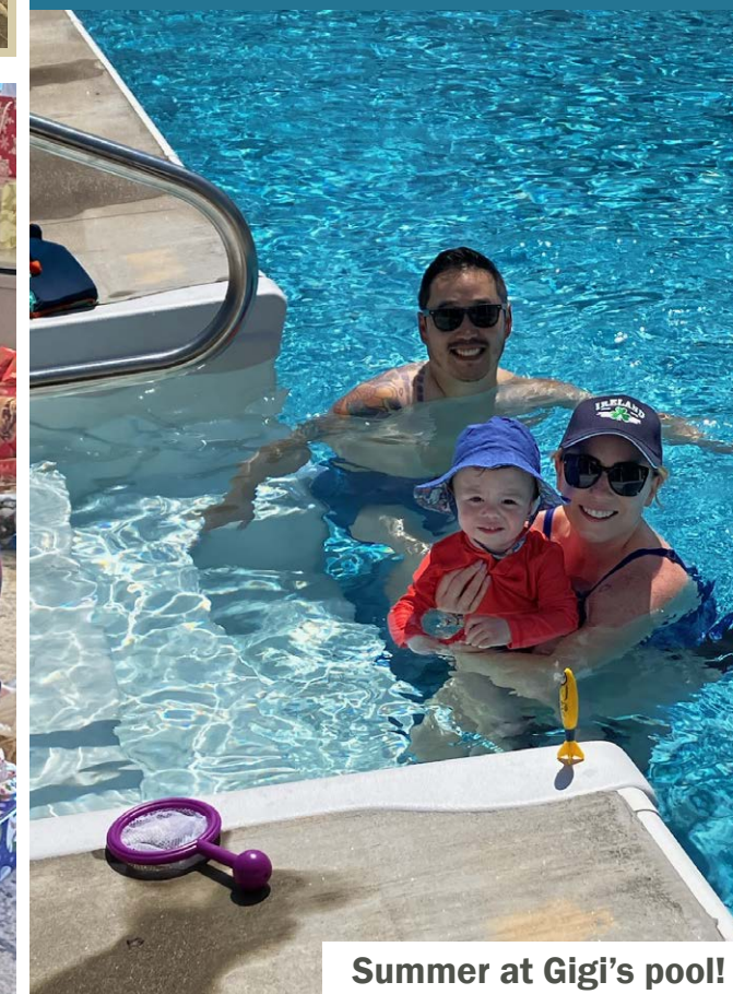
Summer at Gigi's pool!