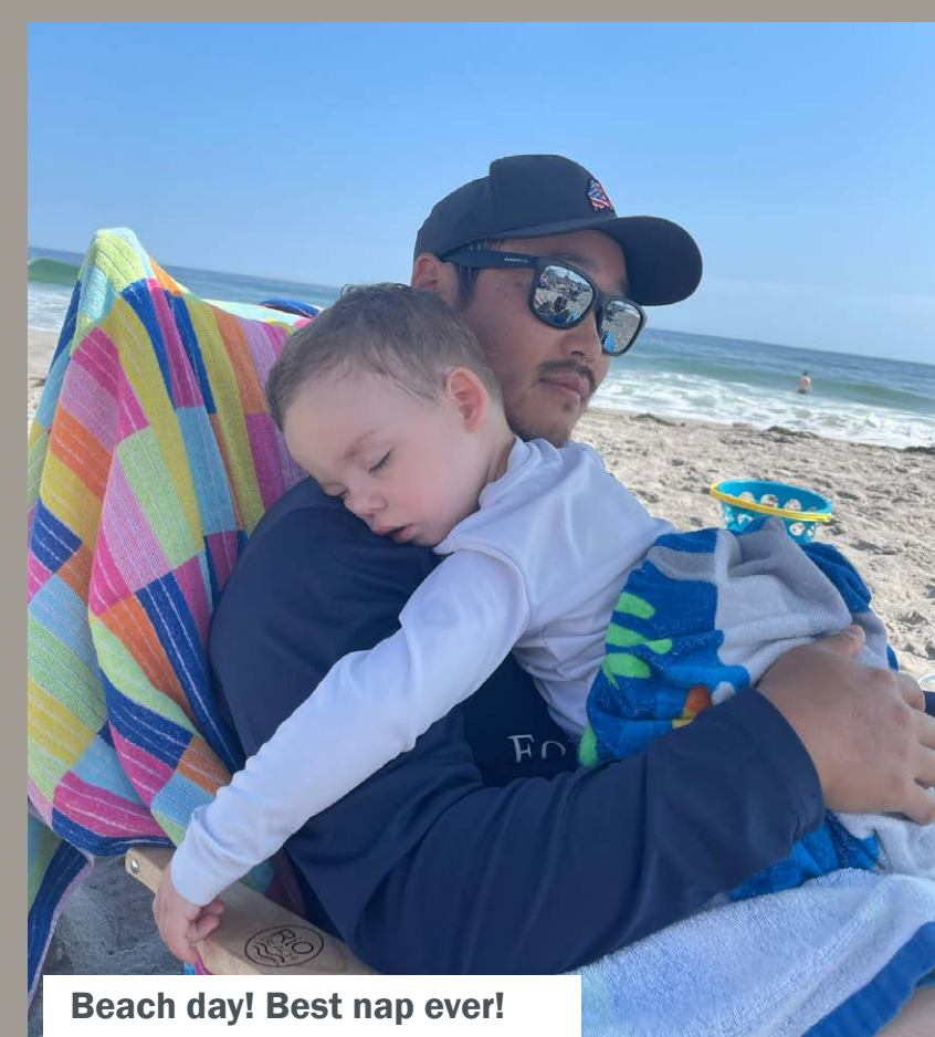
Beach day! Best nap ever!