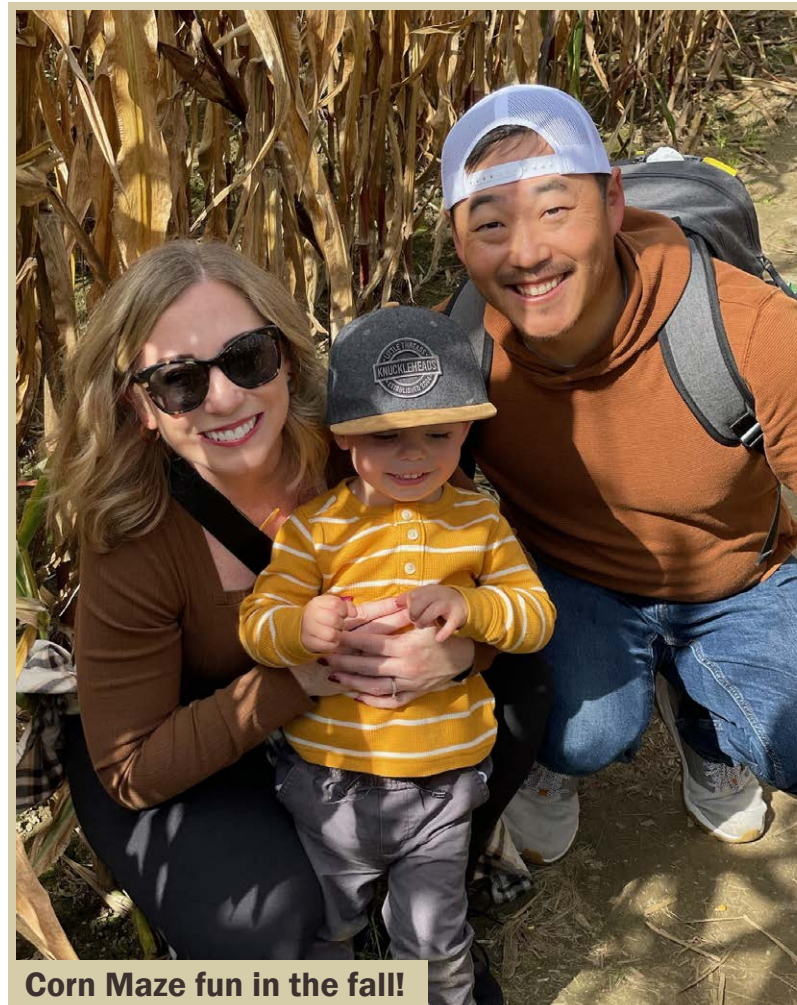
Corn Maze fun in the fall!

Summer: We spend as much time at the pool or the beach, where we pack lunches and all the sunscreen and enjoy music, games, and family for as much of the summer as we can. Fourth of July is a big celebration—Heather's family has an extended family reunion, where we have a lobster bake and endless rounds of karaoke!