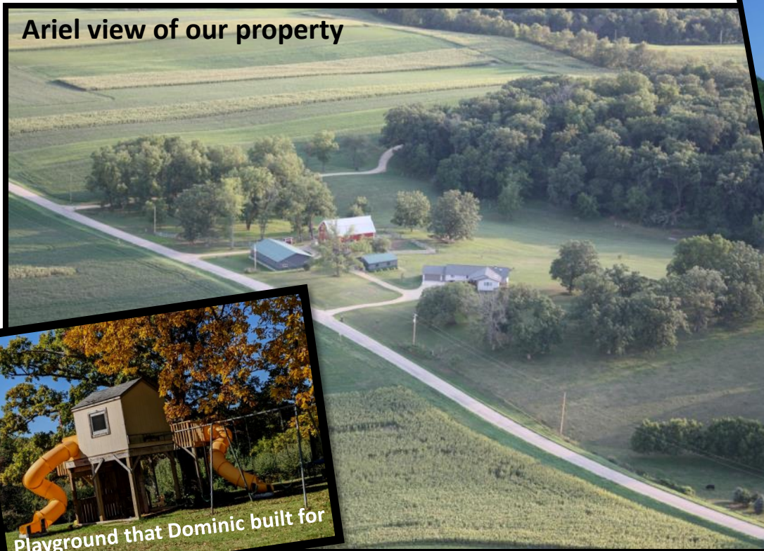
Aerial view of our property