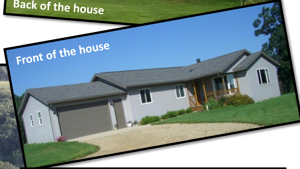
Front of the house