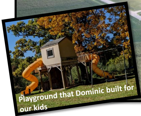
Playground that Dominic built for our kids