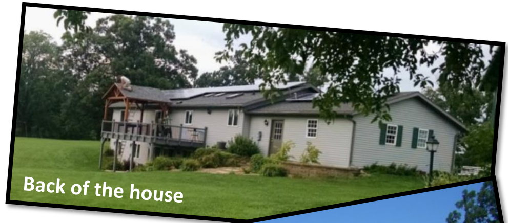
Back of the house

We now have a beautiful 5,000 sq. ft. home, complete with 6 bedrooms and 4 bathrooms. We have solar panels on our roof that produce the energy we use. There's a huge yard for the kids to play in, a fun playground that Dominic built, a campfire area, and lots of exciting places to explore!