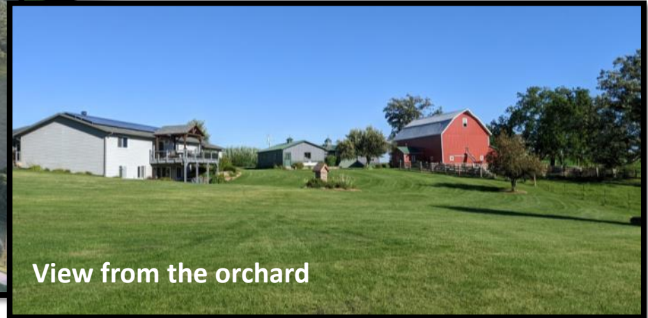
View from the orchard