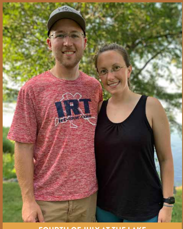
FOURTH OF JULY AT THE LAKE

We live in a quiet neighborhood where children are usually riding their bikes and running from house to house to play with one another.